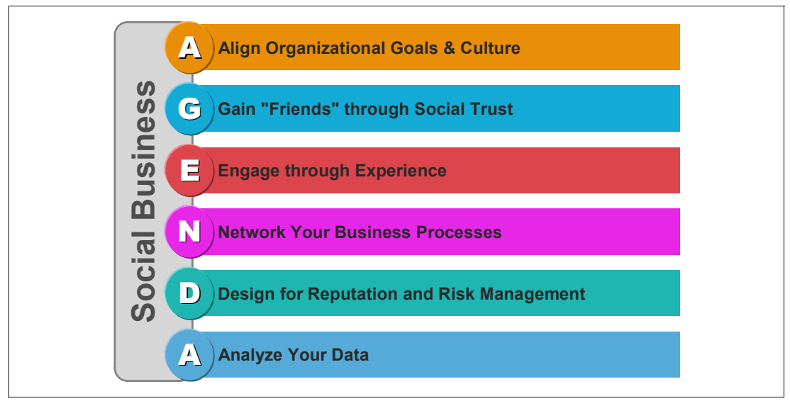
Figure 2 Social Business Agenda

The Social Business Agenda is a framework that guides companies through the actions and choices that are necessary to achieve value from social technologies across the ecosystem of employees, channels, partners, customers, and the public. Figure 2 shows an overview of the Social Business Agenda.